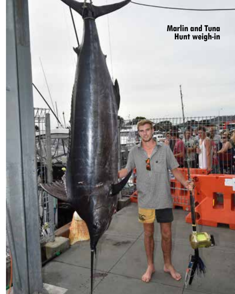
Marlin and Tuna Hunt weigh-in