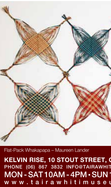
Flat-Pack Whakapapa – Maureen Lander