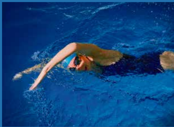
Swim the Distance Challenge 1 August