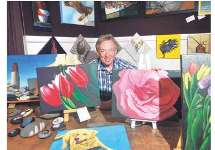
Winter Arts and Crafts Fair - July 14

Watch the 10 best five-minute films made during 48hours, with awards aplenty for the 2019 champions. Dome Room, PBC, 38 Childers Rd, 7-10.30pm. Tickets: $22.50 at eventfinda.co.nz